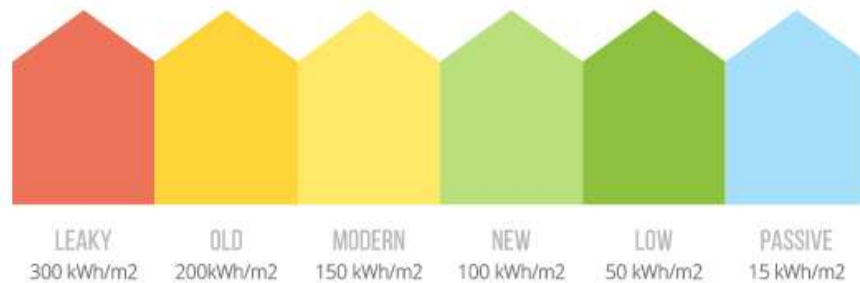
Figure 4. Towards passive house, heating need per unit floor area clasification [6]

The CO 2 emissions related to the two models are similar in value. This result confirms a broader study that indicates that for houses with higher levels of thermal performance, the size itself is a less significant factor of overall emissions [7].