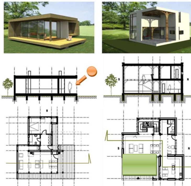
Figure 1. Architectural solutions for the evaluated houses (Renderings, specific sections and first-floor plans)